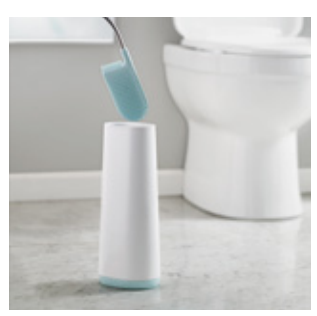
Flex™ (70506) Blue (70515) Grey Dimensions H43.1 x W12.3 x D8.7 cm (H17 x W4¾ x D3½ inches)