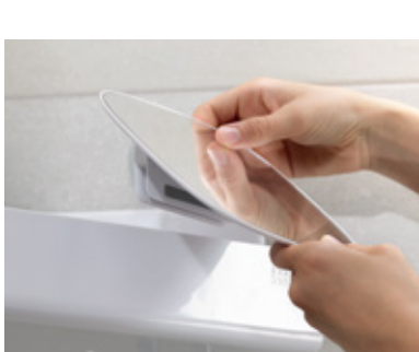
EasyStore<sup>™</sup> Compact shower caddy with adjustable mirror (70547) White Dimensions H21 x D13 x W15.5 cm