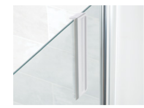
EasyStore<sup>™</sup> Compact squeegee with hanging hook (70535) Grey Dimensions H25 x W5.3 x D4.5 cm (H9¾ x 2¼ x 1¾ inches)