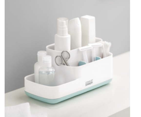
Perfect for a wide variety of grooming essentials

This versatile caddy has been designed to better organise your bathroom space. It's divided into a range of compartments of varying shape, size and depth to cope with storing the wide variety of grooming essentials commonly found in most bathrooms. Perfect for keeping small items such as scissors, brushes, deodorants, dental floss and make-up neat and tidy and easy to find. Also features a non-slip base. Wash and dry by hand.