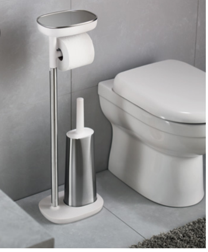
EasyStore<sup>™</sup> Plus toilet paper stand comes with a Flex<sup>™</sup> Steel Toilet brush