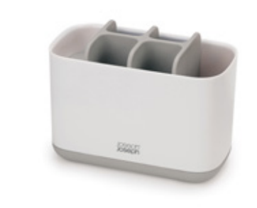
EasyStore<sup>™</sup> Large Toothbrush Caddy (70501) Blue (70510) Grey