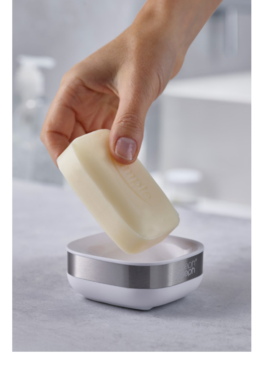
Slim<sup>™</sup> Steel Compact soap dish Wash and dry by hand. Do not use abrasive cloths or strong chemical cleaners.