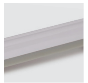
Flexible silicone blade for precision cleaning