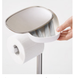
Discrete compartment for storing sanitary items