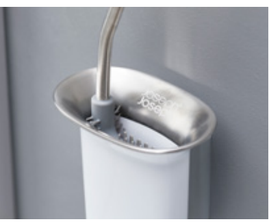
Stainless-steel shaft and holder trim