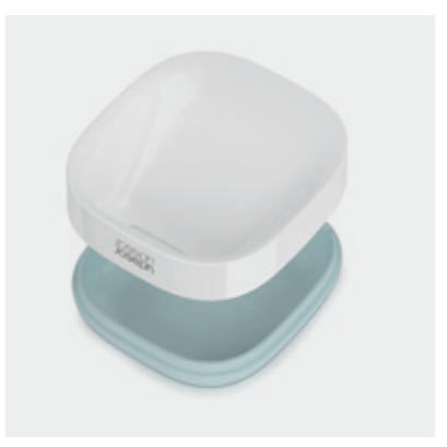
Dismantles for easy cleaning