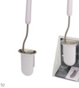
(70528) White Dimensions H43.5 x W10 x D8 cm (H17 x W4 x D3<sup>1</sup>⁄<sub>4</sub> inches)