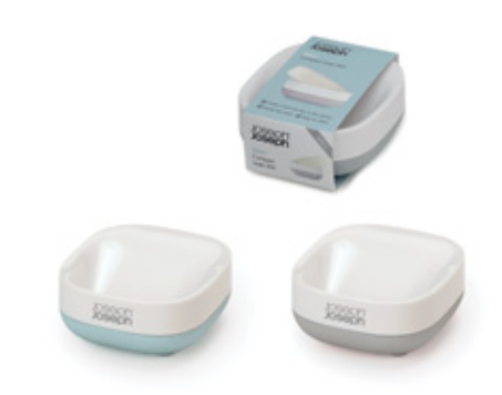
Slim<sup>™</sup> Compact Soap Dish (70502) Blue (70511) Grey Dimensions D7.1 x D8.4 x H3.6 cm (H3¼ x W2¾ x D1½ inches)

Slim<sup>™</sup> Compact soap dish Wash and dry by hand.