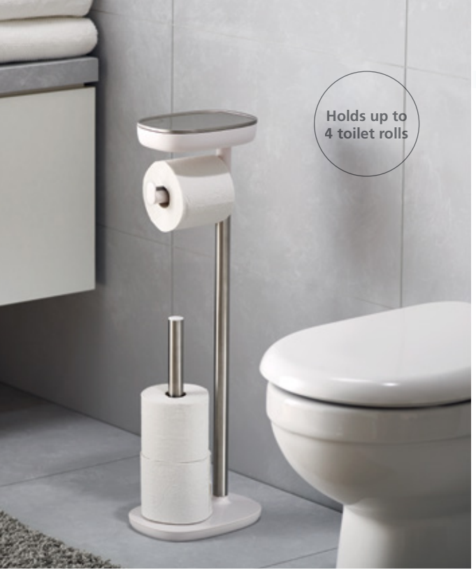
EasyStore<sup>™</sup> Toilet paper stand holds up to 4 rolls